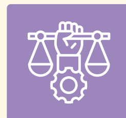
GOVERNANCE AND ETHICS