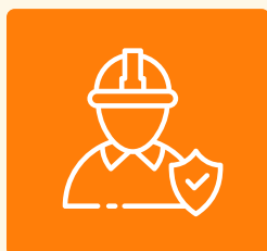
HEALTH AND SAFETY